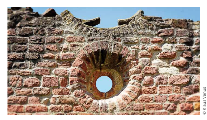
Speyer, Wall of Synagogue

The Jewish communities in Speyer, Worms and Mainz formed in the Middle Ages the federation of ShUM-cities, which profoundly shaped the architecture, culture, religion and jurisprudence of the Jewish world not only in Europe. Monuments such as synagogues, cemeteries and ritual baths (Mikveot) - together with the religious traditions tell of the height of the ShUM-cities.