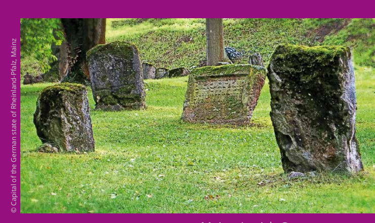
Mainz, Jewish Cemetery