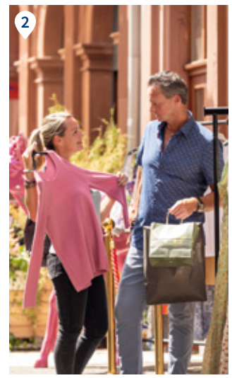
1 Exploring Speyer. 2 On a shopping tour.