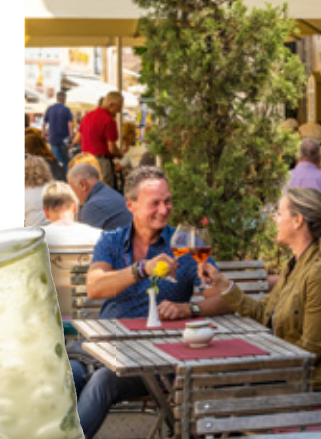
13 Coffeehouse culture. 14 The Palatine Art of Living. 15 The Pretzel. Speyer's traditional pastry.