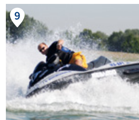
8 SEA LIFE. Fascinating underwater world. 9 Water Ski School Becht & Partner. 10 TECHNIK MUSEUM Speyer.