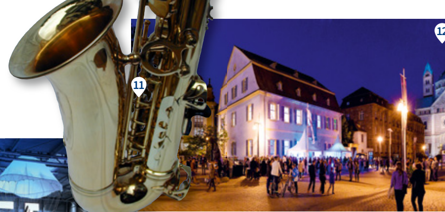
11 Jazz in the City Hall's Courtyard. 12 Kult(o)urnacht. Culture by Night. For the night owl in you.

Kulturhof Flachsgasse Changing special exhibitions by the Speyerer Kunstverein and the Städtische Gallerie, Flachsgasse 3 Feuerbachhaus Speyer Museum with works by Anselm Feuerbach, Allerheiligenstraße 9