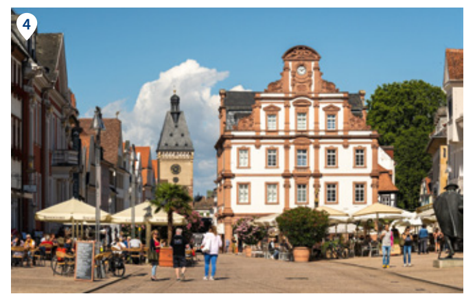
4 Maximilianstraße facing the Altpörtel. 5 Meeting point pedestrian zone.